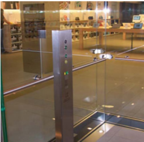
Lift car inside solid glazed masonry shaft