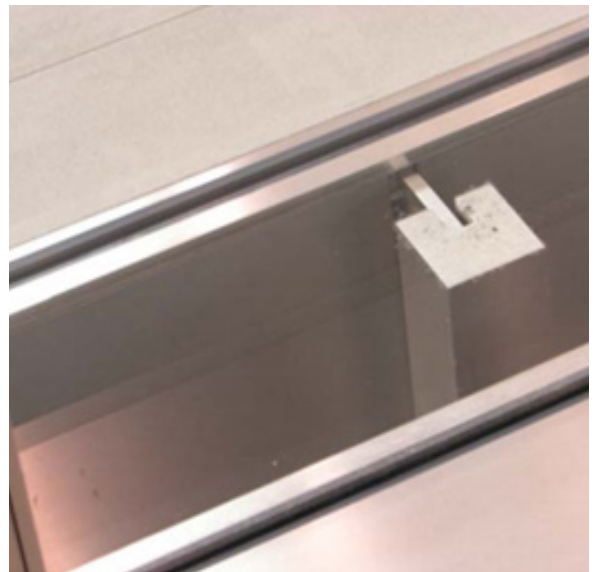
Bespoke minimalist steel work

Apex Lifts Banks Lane Bexleyheath Kent, DA6 7BH Tel: 020 8300 2929 Email: info@apexlifts.com www.apexlifts.com