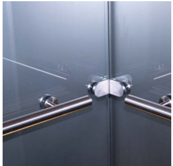
Minimalist design lift interior