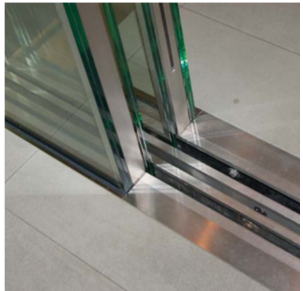
Fully glazed glass landing doors and car doors