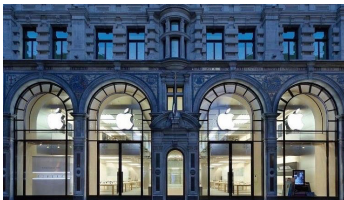
Apple Flagship Store on London's Regent Street