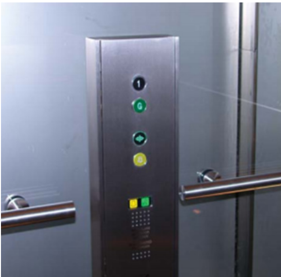
Control Operating Panel (COP)