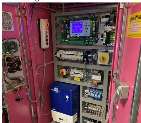
The bespoke pink lift control system at the Centre