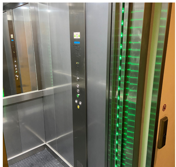
New lift interior and door detector edges

Apex Lifts Banks Lane Bexleyheath Kent, DA6 7BH Tel: 020 8300 2929 Email: info@apexlifts.com www.apexlifts.com