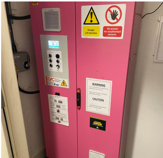
Exterior of bespoke pink lift control system