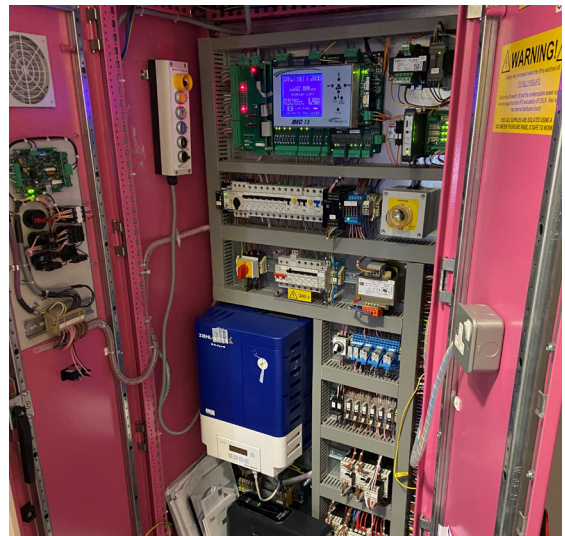
Interior of bespoke pink lift control system