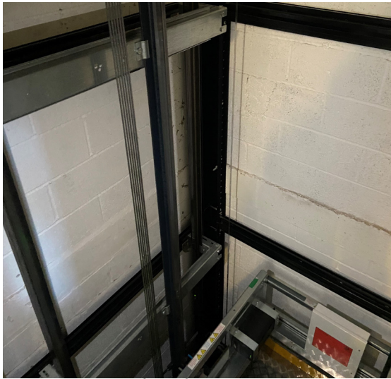
The modernised lift shaft