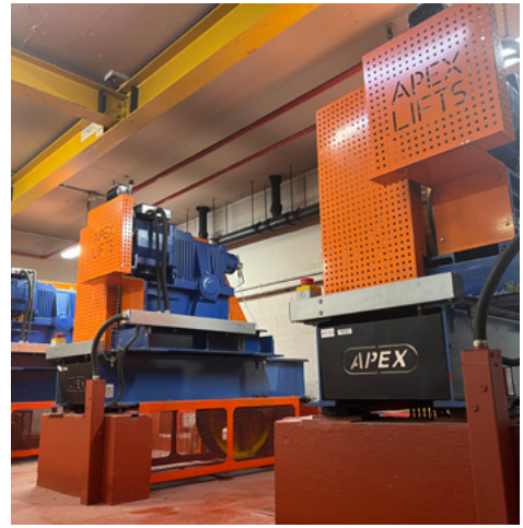
The machines for a group of lifts.