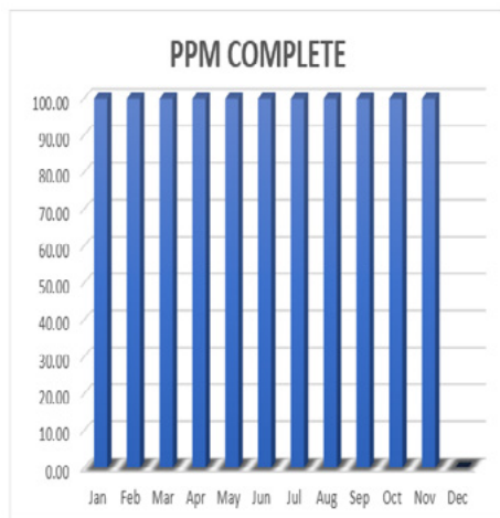
100% PPM (planned preventative maintenance) completion.