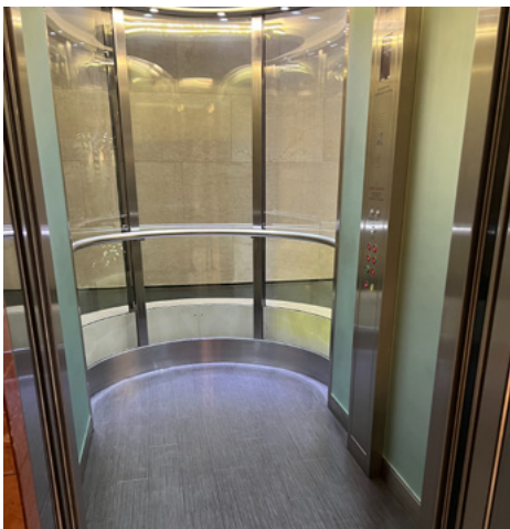
The interior of the scenic wall climber lift.