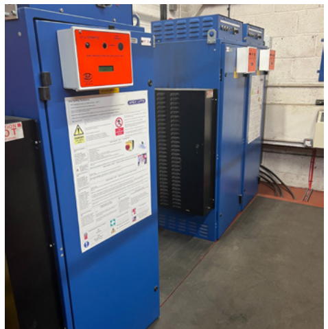
The control panels of the lifts on site.

Apex Lifts Banks Lane Bexleyheath Kent, DA6 7BH Tel: 020 8300 2929 Email: info@apexlifts.com www.apexlifts.com