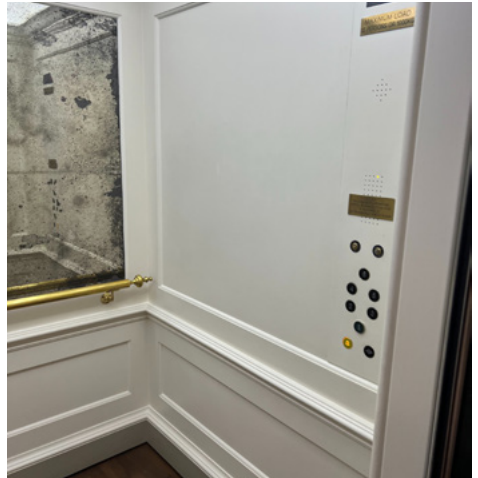
Interior of one of the lift cars on-site.