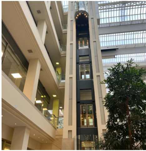
The scenic wall climber lift on-site.