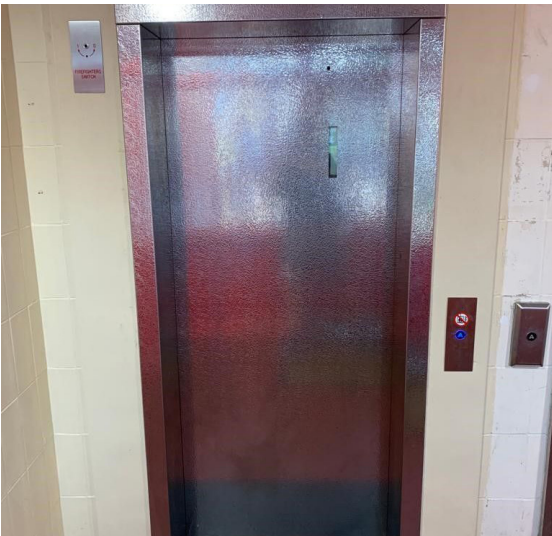
The lift exterior