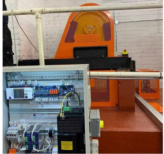
The new lift machine and control panel