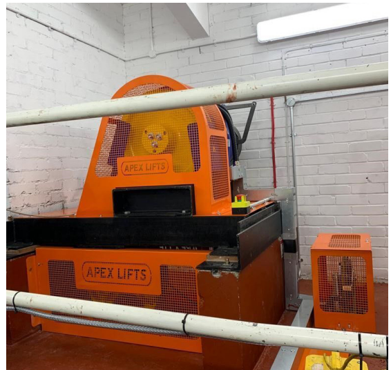
The newly installed gearless lift machine

Apex Lifts Banks Lane Bexleyheath Kent, DA6 7BH Tel: 020 8300 2929 Email: info@apexlifts.com www.apexlifts.com