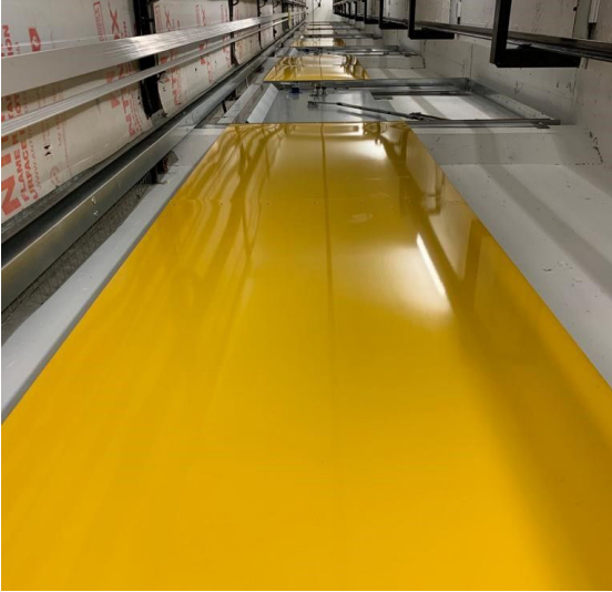
The modernised lift shaft